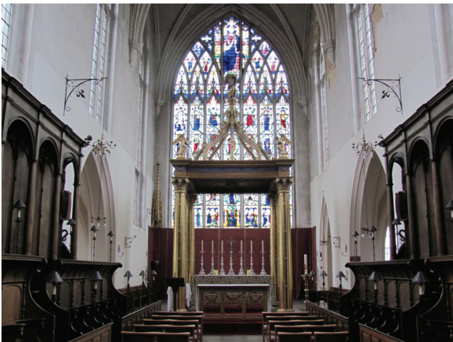
Altar, ciborium and East Window designed by Ninian Comper in the Chapel at All Saints Pastoral Centre, Shenley Lane, London Colney. See article on page 4