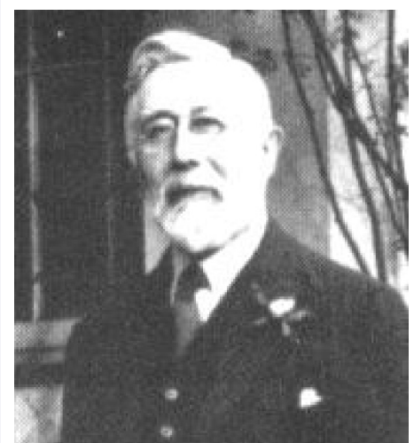
Sir John Ninian Comper

All Saints Pastoral Centre was built in 1901 as a convent for the All Saints Sisters of the Poor; the architect was Leonard Stokes. When in 1927 the sisters decided to add a chapel, they chose Ninian Comper as architect.